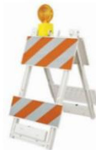
TYPE II BARRICADES WITH YELLOW FLASHING BEACONS